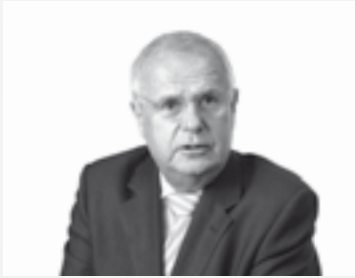
Paul Myners (60) Chairman & Non-executive Director

Appointed to the Board in September 2006 and Chairman in January 2007. Member of the Court of Directors of the Bank of England and Chairman of Guardian Media Group plc, Tate, the Low Pay Commission and The Personal Accounts Delivery Authority. Also a trustee of Glyndebourne and the Smith Institute.